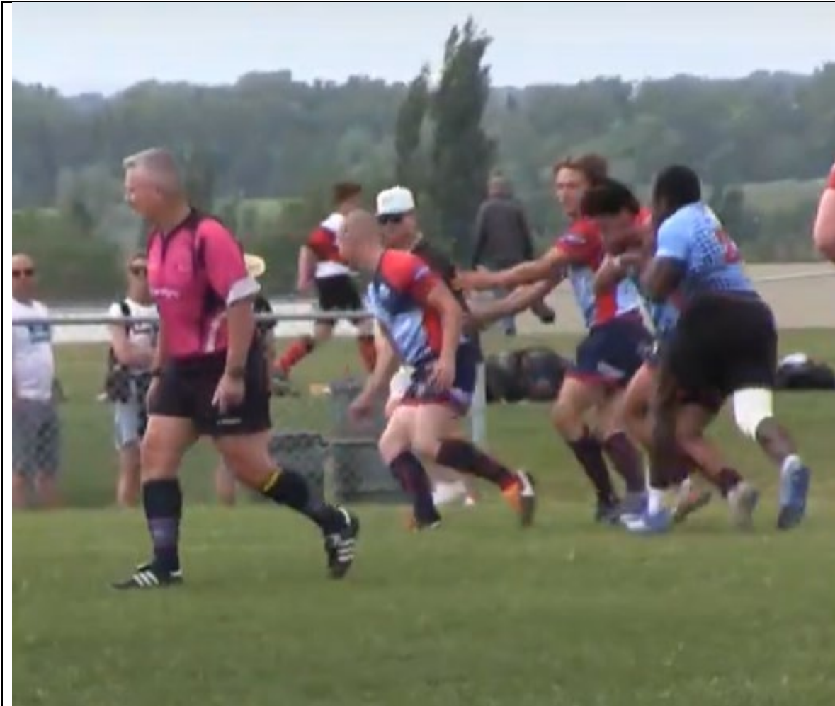
At minute 1:00:16 L23 punches C23 in the back of the head after C23 is thrown to the ground by L7