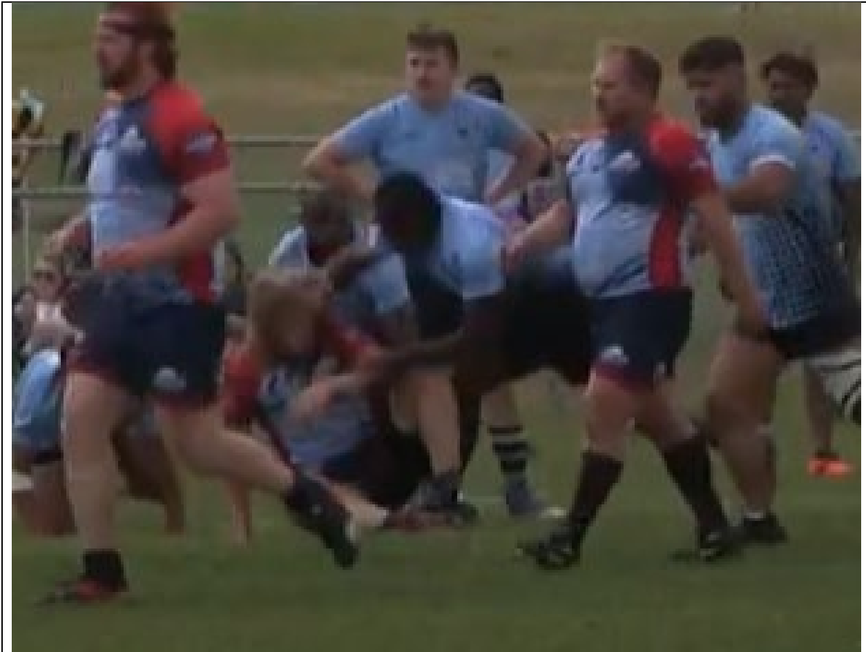
At minutes 1:00:50 After the referee and captains have calmed things down L23 approaches C23 in a boxer's stance and punches C23 in the face causing injuries which required stitches.